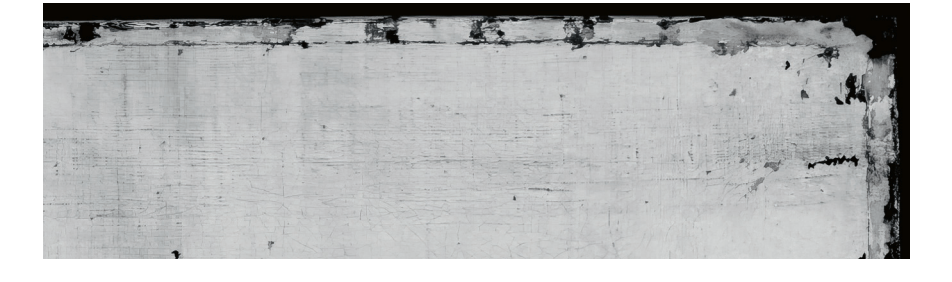
Fig. 2 REMBRANDT, The Standard Bearer (fig. 1a). Detail lead (Pb-L) MA-XRF map showing the original tacking edges that were flattened and incorporated into the picture plane.

Previous publications, including the Corpus of Rembrandt Paintings, have stressed the sober or limited nature of the palette in this painting, suggesting that the brown and grey tones that dominate the costume were deliberate.5 Research, however, shows that the grev and brown colours of the entire costume of The Standard Bearer are in fact the result of discolouration of the blue glass pigment smalt, and the fading of possibly yellow and red lake pigments. The thickly applied translucent brown paint of the costume, baret and large feather contain high amounts of smalt, as indicated by the co-presence of the elements associated with the cobalt ore: cobalt, nickel and arsenic in the MA-XRF maps (fig. 1b).<sup>6</sup> The shadow areas of the figure also contain a lot of calcium, suggesting that the smalt was mixed with a chalk-based yellow lake, now faded, to make a greenish tone. As a result of the discolouration of both pigments, the vigorous brushwork in the shadow areas - visualized in the cobalt MA-XRF map – can no longer be seen with the naked eye (figs. 3a-c).