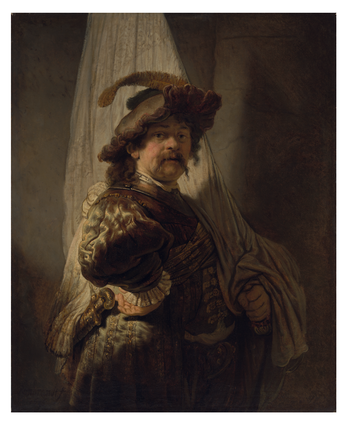
Fig. 1a REMBRANDT, The Standard Bearer, 1636. Oil on canvas, 120.5 x 97.5 cm. Signed and dated,

lower left in dark brown paint: Rembrandt f/1636 . Amsterdam, Rijksmuseum, inv. no. 5K-A-5092.