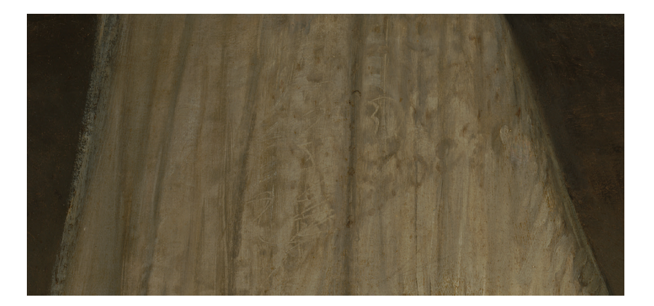
Fig. 4 Detail of the decoration in the upper part of the white standard in REMBRANDT, The Standard Bearer (fig. 1a).

The broad brushstrokes of light brown and grey used to roughly indicate the folds and the decorative pattern at the top of the standard are a mixture of yellow ochre and black applied on top of the lead white layer of the banner. Using MA-XRF imaging and RIS, the ochre was identified as goethite based on its characteristic spectral feature.10 A lively flourish scratched into the wet brown paint hints at a possible inscription, but no letters can be made out (fig. 4). Considering lead white, black and ochre are stable pigments that do not generally discolour, a white standard was clearly intended. The possibility exists therefore that it was indeed chosen to reflect the original owners' residence in Delft's White District.